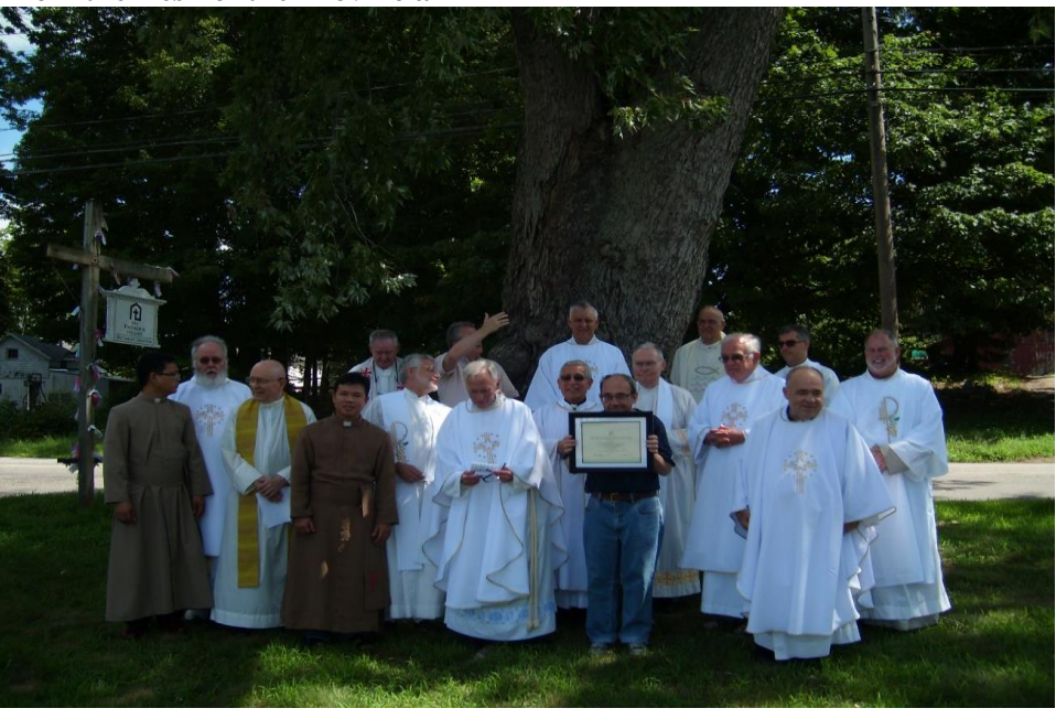
From the Desk of the Provincial